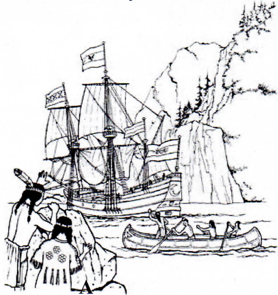
Native Americans on the Hudson River

Jesus offers a river of life to those who believe on Him!