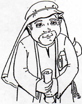
Shaphan (History) government concern.

Counting people is called taking a census . A census can be taken to find the number of tax payers . It may also be conducted to find the number of able-bodied soldiers . The government has many reasons for wanting to know the size of its population. Sometimes, a census can ask personal questions about things that the government does not need to know. It is important that a census only ask questions that are of rightful