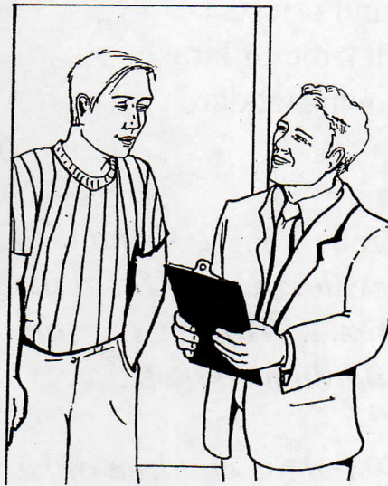
A Modern Census