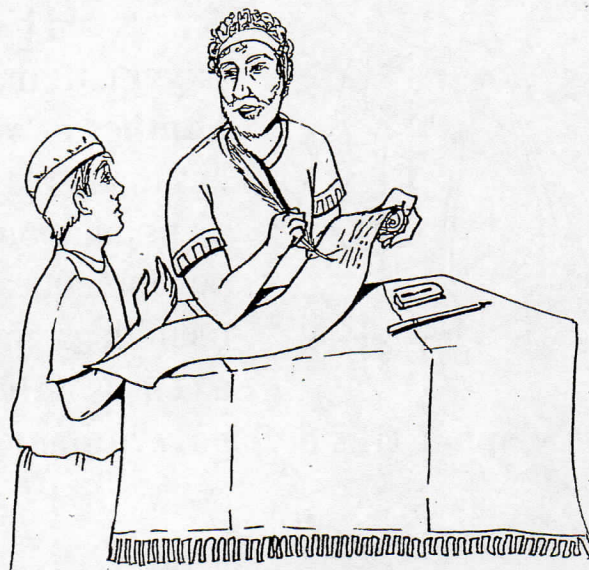
A Census Being Taken

God told the Children of Israel that they could dedicate certain people or animals to the service of the Lord. God commanded that the people and priests be numbered. Each tribe of Israel was to have its own standard (banner.)